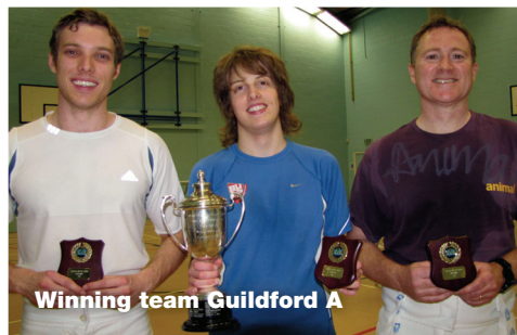
Winning team Guildford A

There were only six teams this year in what was a good-natured but highly competitive competition