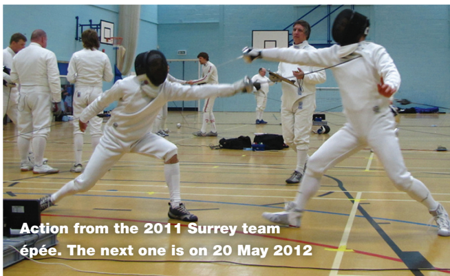
Action from the 2011 Surrey team épée. The next one is on 20 May 2012