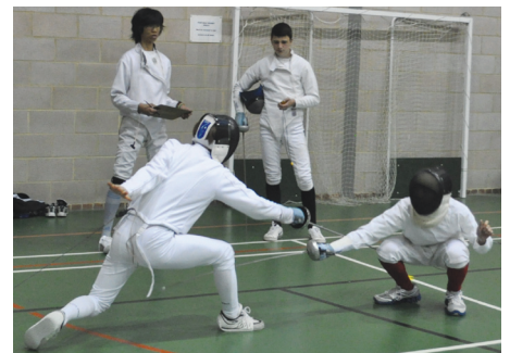
Above: competitors experimenting with the double hit timing

This year there were 21 fencers, 19 men and two women fighting it out in Epsom College. It was typical Cauchard cup weather – hot sunshine and blue skies outside but comfortably cool in the venue.