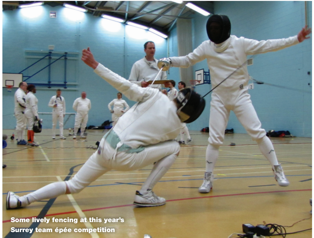
Some lively fencing at this year's Surrey team épée competition